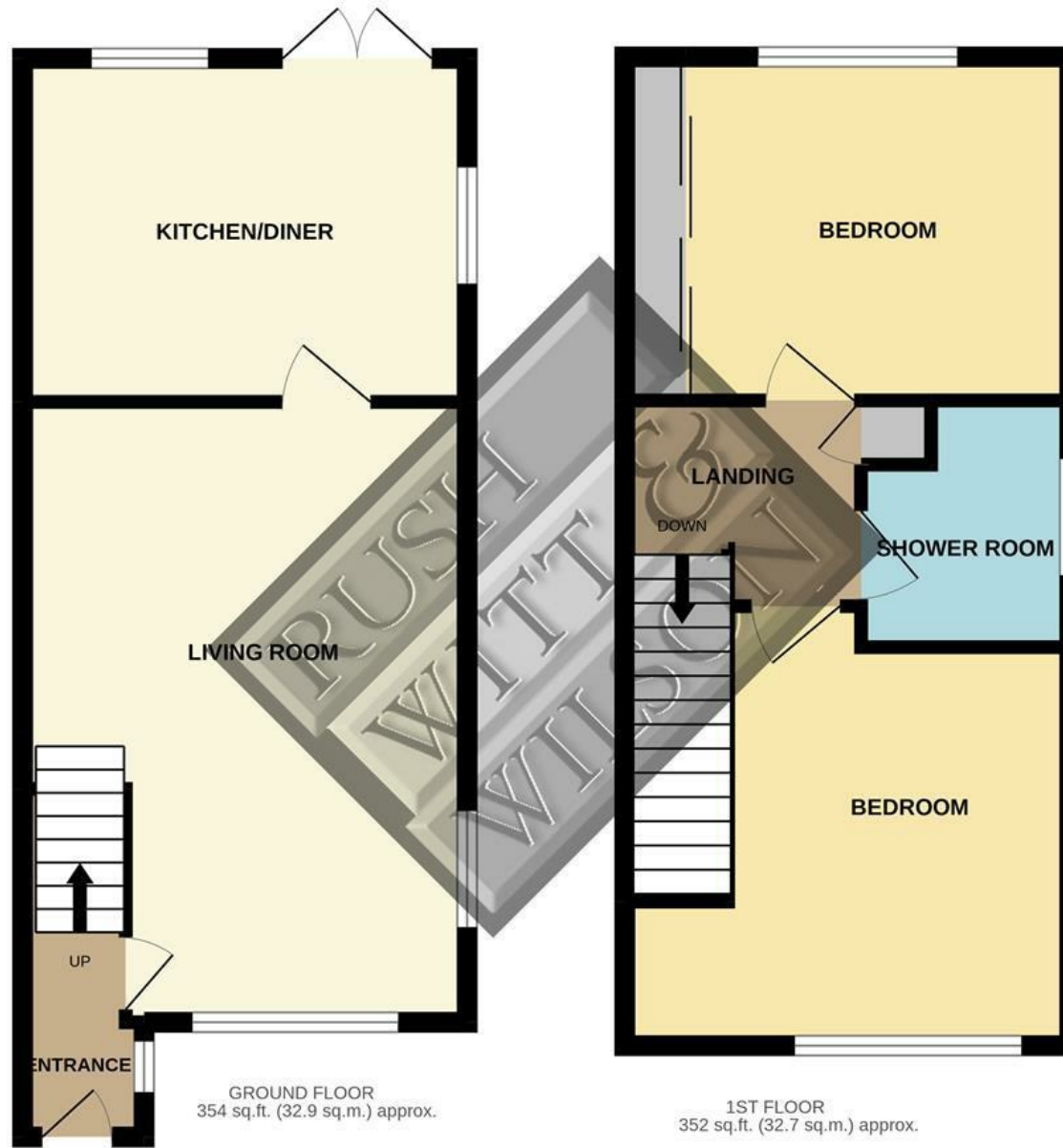
GROUND FLOOR 354 sq.ft. (32.9 sq.m.) approx.